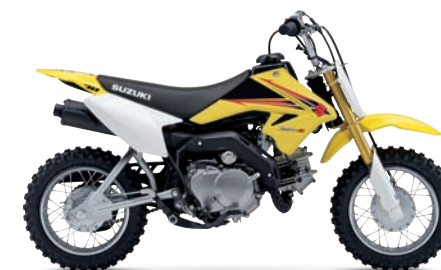
Champion Yellow No.2 (YU1)

Specifications, appearance, colors (including body color), equipment, materials and other aspects of the "SUZUKI" products shown in this catalogue are subject to change by Suzuki at any time without notice, and they may vary depending on local conditions or requirements. Some models are not available in some regions. Each model may be discontinued without notice. Please inquire at your local dealer for details of any such changes.