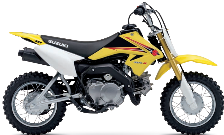
Champion Yellow No.2 (YU1)