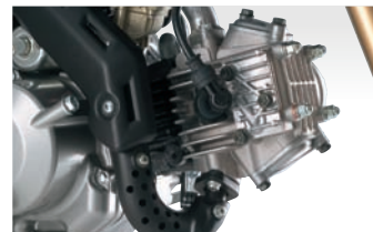
67cm 3 engine