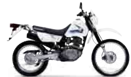
Solid Special White No.2 (30H)

Specifications, appearance, colors (including body color), equipment, materials and other aspects of the "SUZUKI" products shown in this catalogue are subject to change by Suzuki at any time without notice, and they may vary depending on local conditions or requirements. Some models are not available in some regions. Each model may be discontinued without notice. Please inquire at your local dealer for details of any such changes.