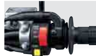
Push-button electric engine starter