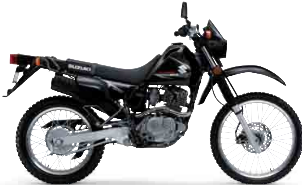
Solid Black (019)