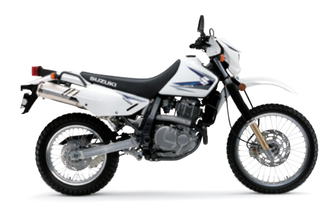
Solid Special White No.2 (30H)

Specifications, appearance, colors (including body color), equipment, materials and other aspects of the "SUZUKI" products shown in this catalogue are subject to change by Suzuki at any time without notice, and they may vary depending on local conditions or requirements. Some models are not available in some regions. Each model may be discontinued without notice. Please inquire at your local dealer for details of any such changes Always wear a helmet, eye protection and protective clothing. Enjoy riding safely.