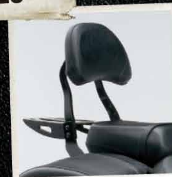
Backrest & Backrest Mount