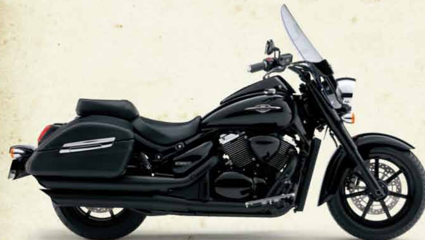
Glass Sparkle Black (YVB)