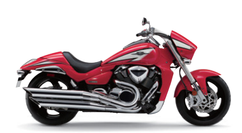
Pearl Mira Red (YVZ)